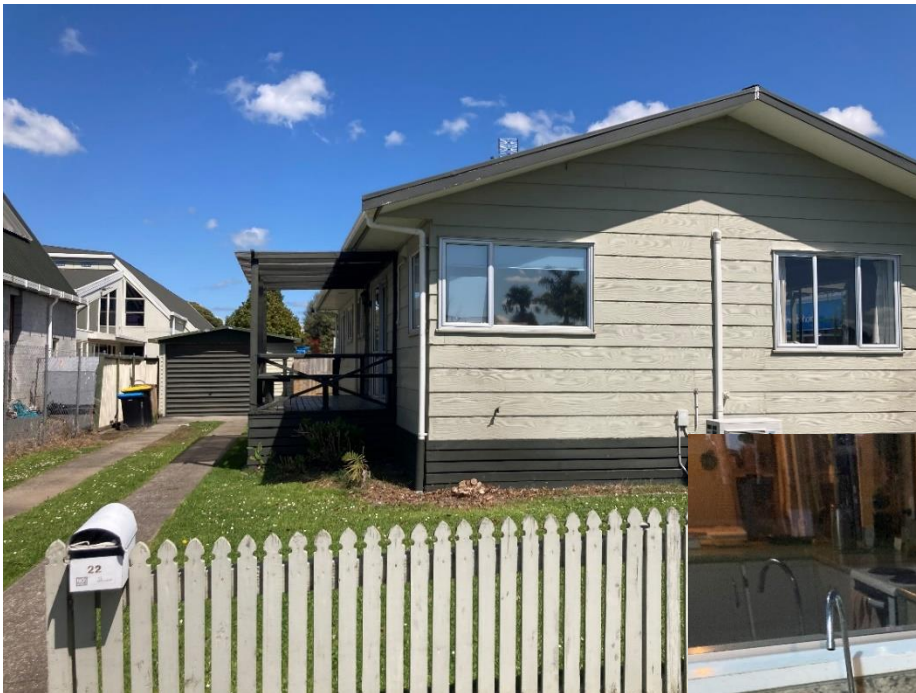
After being tenanted for many years, a tired 22 Raleigh Street is ready for an upgrade.