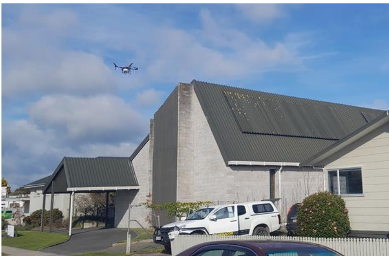
Drone spraying of the complex roof