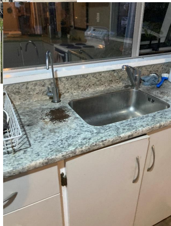
A few months' worth of work is ahead to get this property ready for tenancy. Thanks to the MoW most of the labour is free.